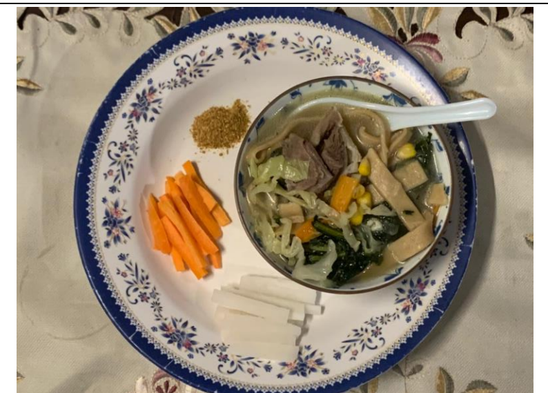
Some Glimpses of Cooking Competition organized by Institute of Hotel Management Pusa dated 22 nd – 26 th January 2021