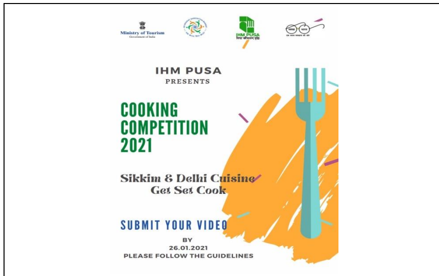
Poster of Theme Based, Cooking Competition organized by Institute of Hotel Management Pusa dated 22 nd – 26 th January 2021